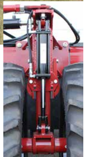
Optional rear strut cylinders for ease of operation.