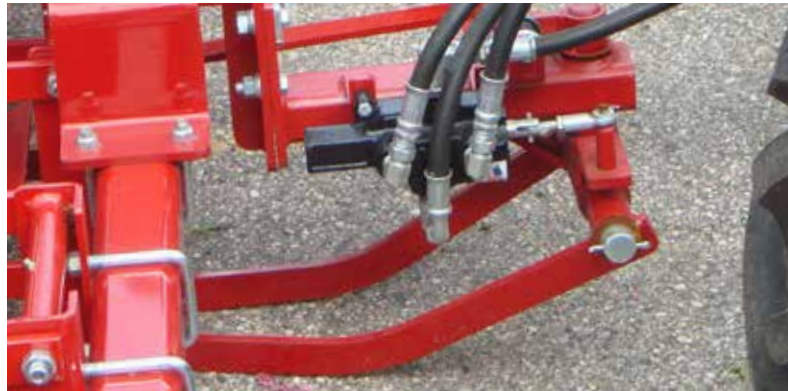
Optional row finder keeps the defoliator on the row.