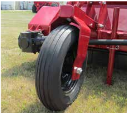
Stabilizer wheels are standard equipment.